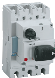
4 210 00